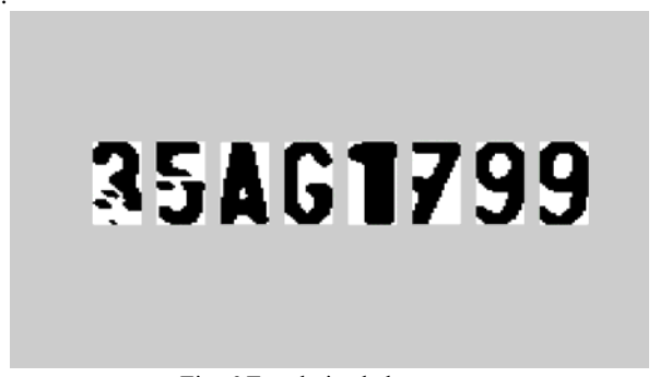
Fig. 6 Equal-sized characters

Before recognition algorithm, the characters are normalized. Normalization is to refine the characters into a block containing no extra white spaces (pixels) in all the four sides of the characters. Then each character is fit to equal size as shown in Figure 6.