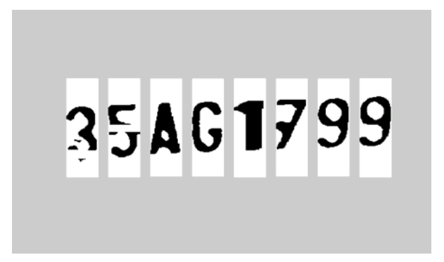
Fig. 5 Individual characters

The next step is to cut the plate characters. It is done by finding starting and end points of characters in horizontal direction. The individual characters cut from the plate are as follows in Figure 5.