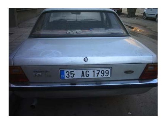
(a) Captured image

Plate region extraction is the first stage in this algorithm. Image captured from the camera is first converted to the binary image consisting of only 1's and 0's (only black and white). by thresholding the pixel values of 0 (black) for all pixels in the input image with luminance less than threshold value and 1 (white) for all other pixels. Captured image (original image) and binarized image are shown in Figure 1(a) and 1(b) respectively.