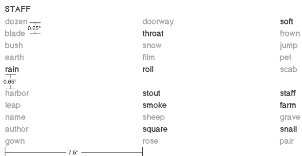
Figure 2. Layout with 10 blue words (drawn here as black), and with red words present. The precue “STAFF” would have disappeared when everything else appeared. All angle measurements are in degrees of visual angle.

Figure 2 shows a layout from one trial. All trials contained six groups of left-justified, vertically-listed words on a white background. The groups contained five words of 18 point Helvetica font with 0.65 degrees of vertical angle between the centers of adjacent words (0.45° for word height, and 0.2° for blank space). The groups were arranged in three columns and two rows. Columns were 7.5 degrees of visual angle from left edge to left edge. Rows were separated by .65 degrees of visual angle. All distractor words were either blue or red. The target word and precue